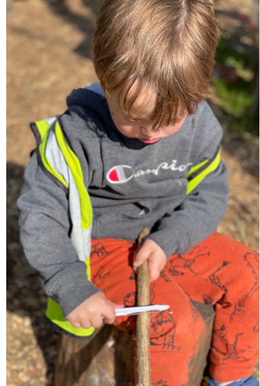
Tool skills using tools for a purpose, the blood bubble, working together.