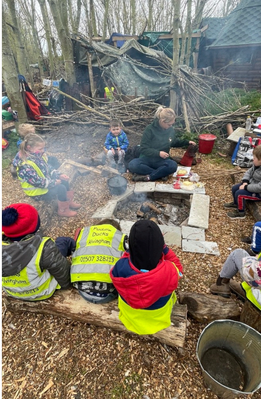
Learning how to stay safe around fire but also how to look after the fire, be safe round the fire and also how to cook on the fire.