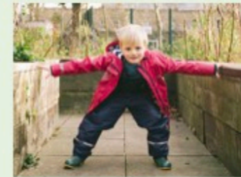
When we are warm and dry our learning is able to happen