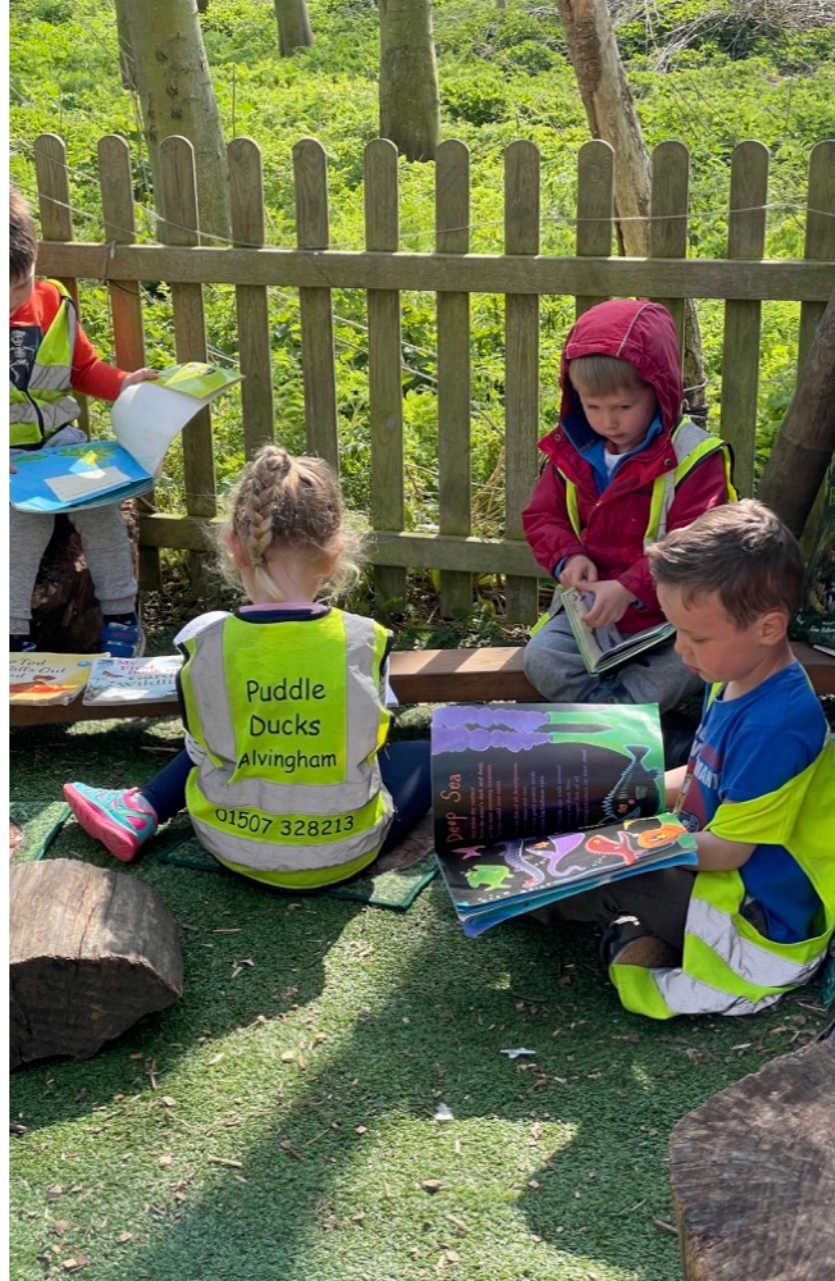
Being independent, leading their own learning through their own interest.